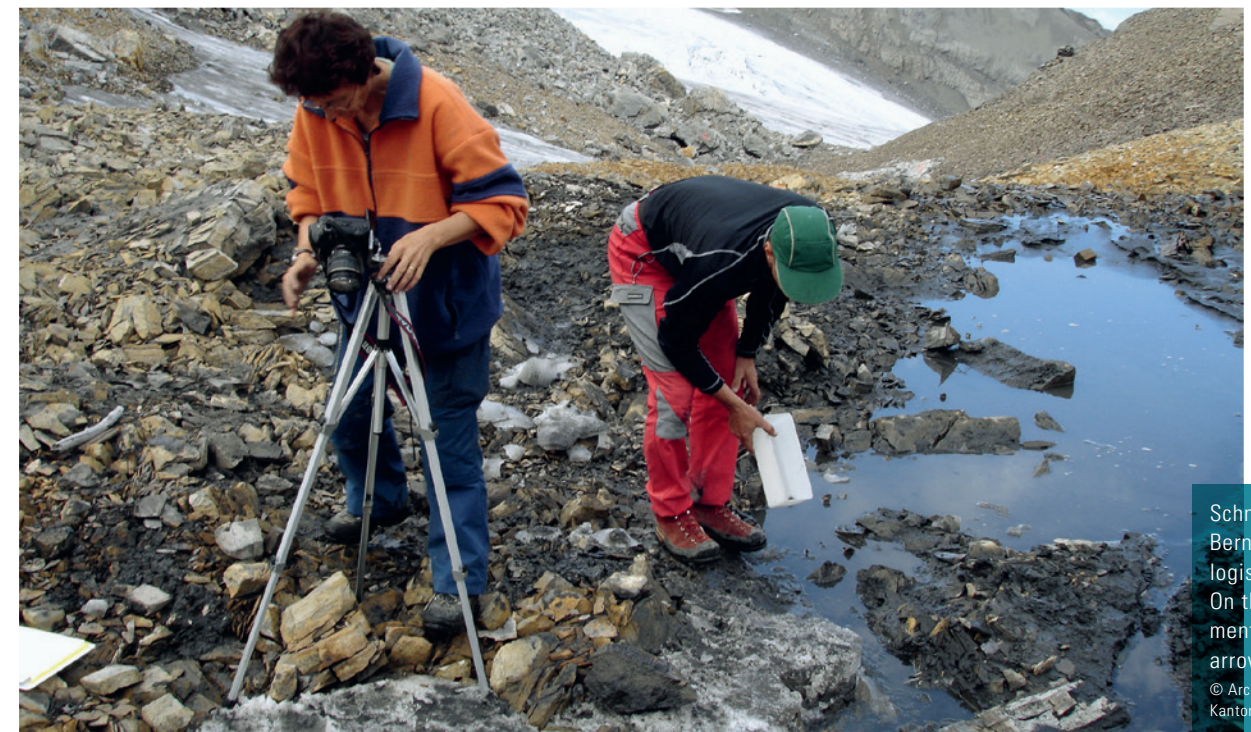
Schnidejoch (2755 m, Berne/Valais): archaeologists clear remains. On the right, a fragment of the Neolithic arrow quiver.