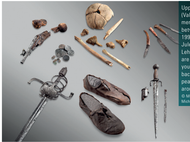
Upper Theodul Glacier (Valais): the "Theodul mercenary", discovered between 1984 and 1990 by Annemarie Julen Lehner and Peter Lehner. The objects are the belongings of a young man of wealthy background who disappeared in the glacier around 1600.